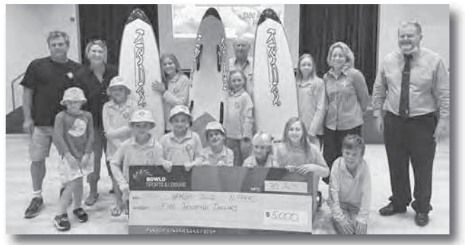
Yamba Bowling Club Presentation to Nippers