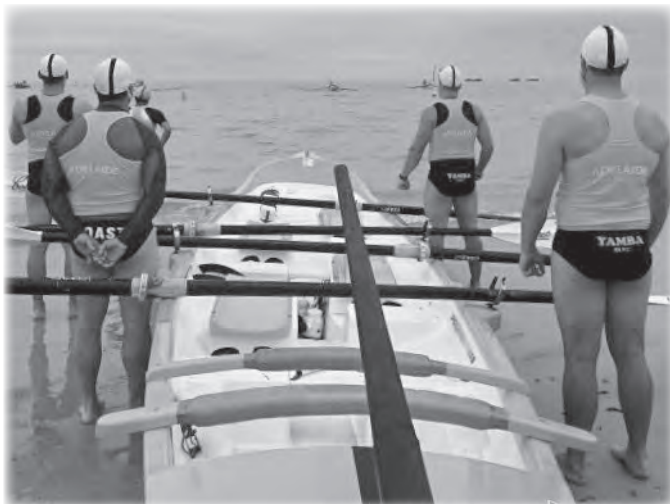
Yamba Kooks Reserve Boat Crew – World Titles S.A.