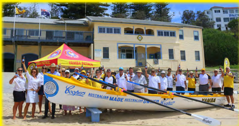
Christening of the new surf boat by Member for Page, Kevin Hogan, with club members.