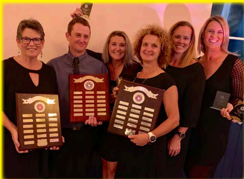
Far North Coast Branch Awards of Excellence winners