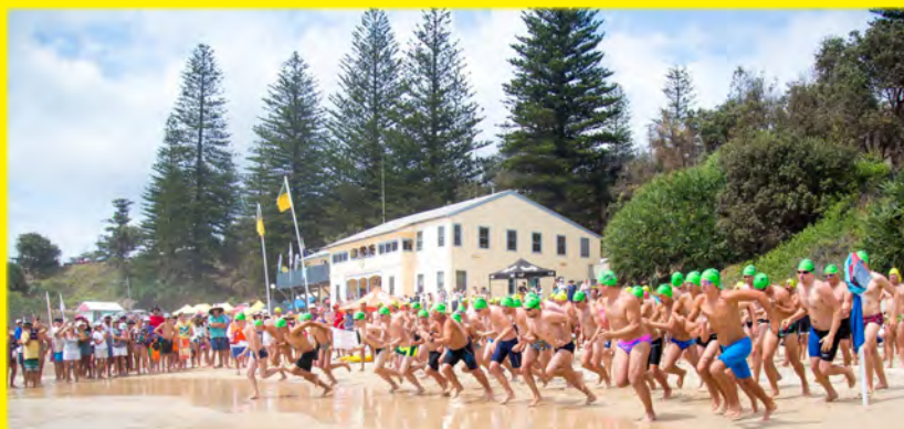
Start of the Male 2km Ocean Swim event