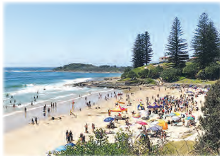
Rotary Fun Day - Main Beach