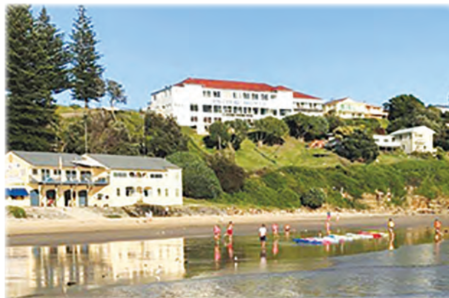
Morning training on Main Beach