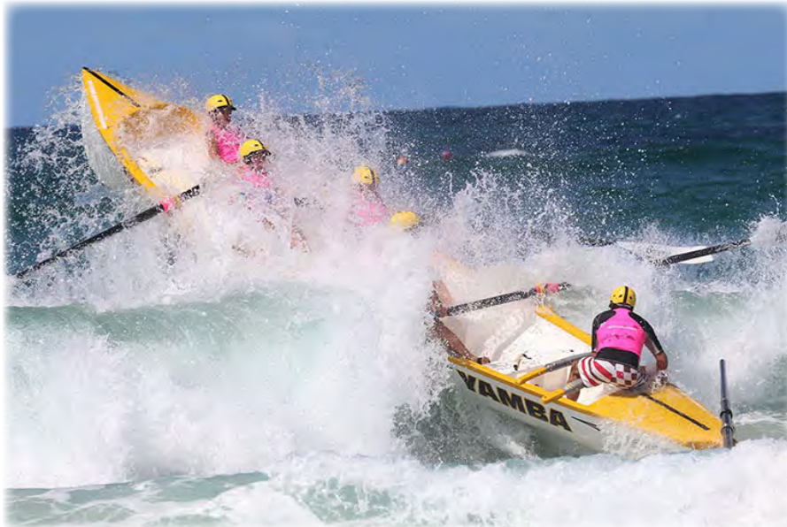
Female Boat Crew