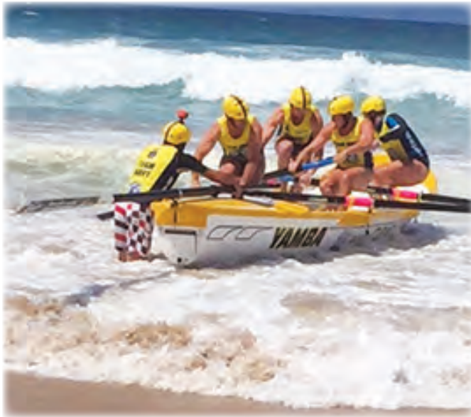
Male Reserve Boat Crew