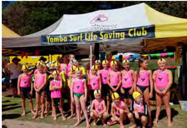
Yamba Nippers competitors at the surf carnival on Main Beach.