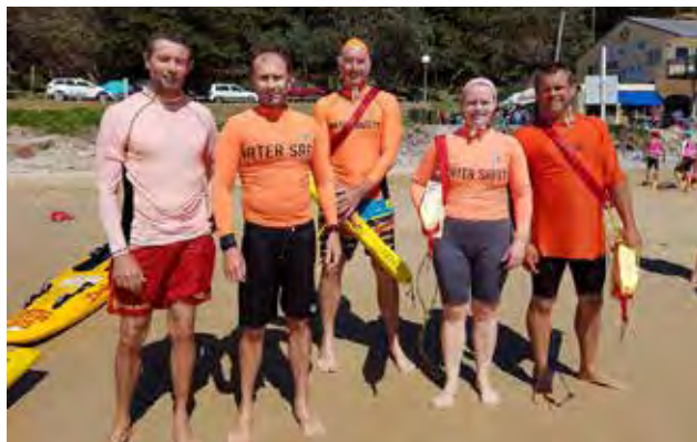
Nippers water safety helpers ready for action

Many thanks to all report and photographic contributors.