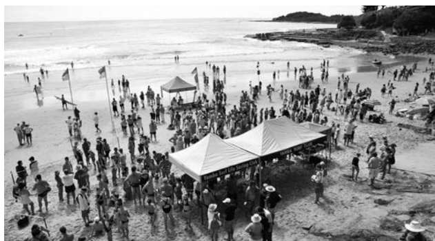
Crowd gathering – Ocean Swim Day, January 2012