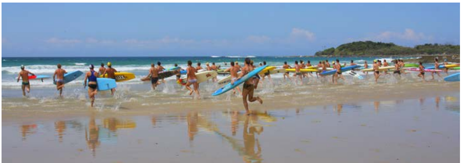
Start of the Jacob Lollback Memorial Board Race – Main Beach.