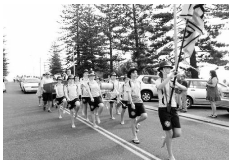
Nippers March Past team participating in the Anzac Day march in Yamba.