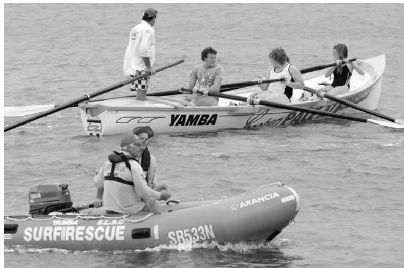
Yamba club members assisting with activities at the FNC Branch Under 17 Development Camp held at Yamba in April.