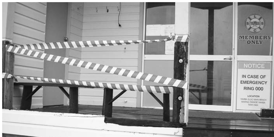
Yamba Surf Club sustained considerable damage during the night of June 6th 2012 as a result of a huge swell and king tide.