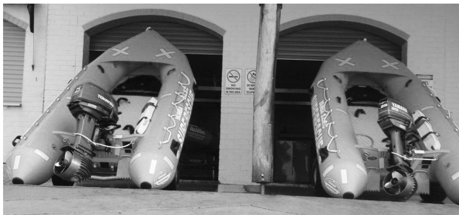
Yamba's new IRBs purchased following the fire that destroyed most of the club's rescue equipment.