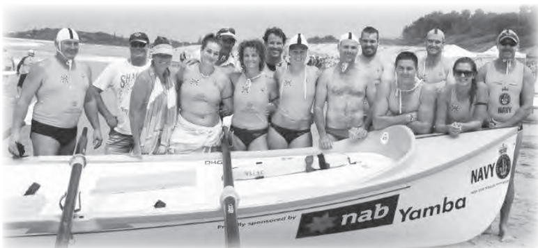
Yamba's boat rowers competing at the Coffs Harbour carnival.