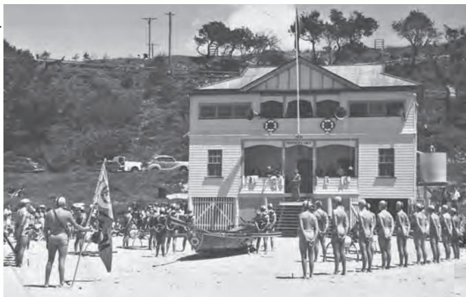
Yamba Clubhouse 1952