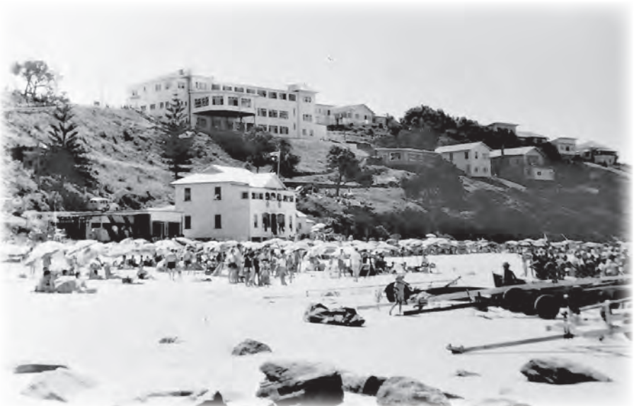
Main Beach surf carnival in the early 1960's