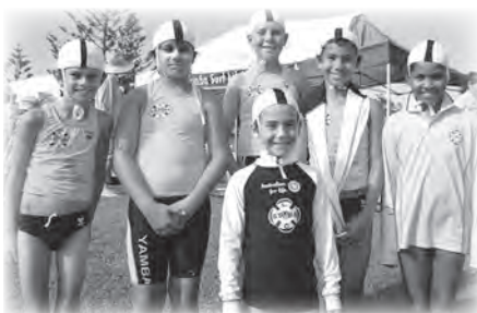
Keen Yamba competitors at the Lennox Head Nippers Carnival.