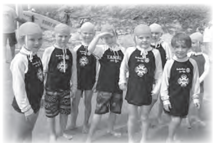
U/6 nippers ready to start Sunday beach activities.