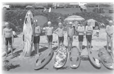
U/12 and U/13 nippers lining up for Sunday morning board activities.