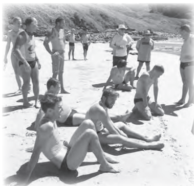
Competitors catching their breath between events at the Club Championships.