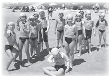
U/8 nippers preparing for water activities at Main Beach